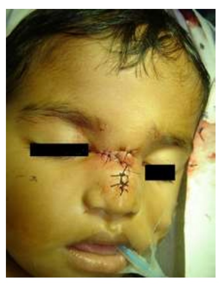
Figure 4 Postoperative view of the patient of figure 3 after the subsidence of infection

The patient was treated with antibiotics and operated on two months later as the infection subsided ( Figure 4 ). In another male patient (case number 8), it was an incidental finding. Parents were unaware of the consequences of the condition.