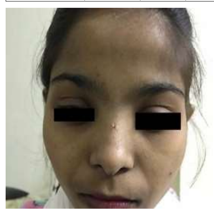
Figure 1 14 years old girl with recurrent congenital nasal dermal sinus

In a female patient, the diagnosis of this condition was made at the neonatal period. She had anorectal malformation as well. The punctum region's incomplete excision was only done at five months of age and her anal transposition operation. She had a recurrence and came for treatment at 14 years of age ( Figure 1 ). Re-operation was done with complete excision of the tract.