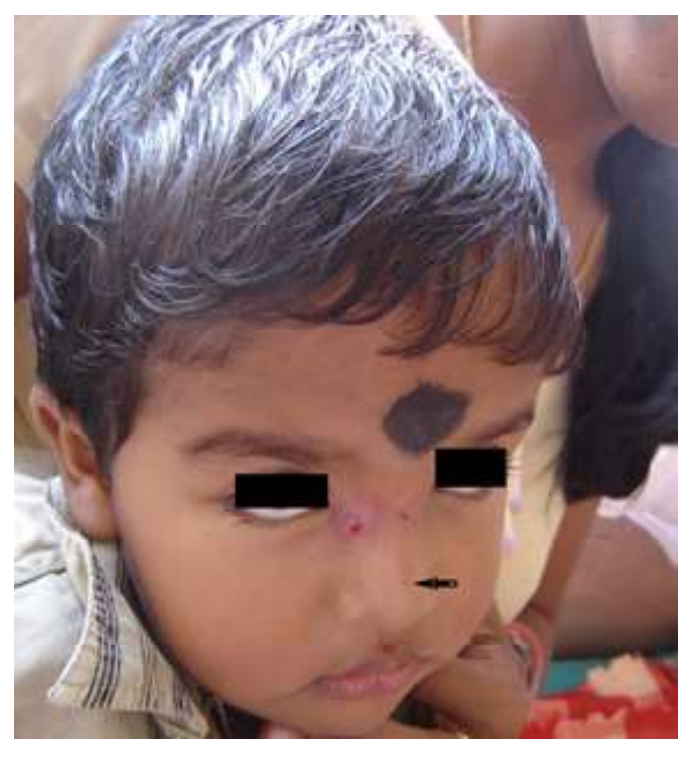
Figure 3 Infected nasal dermal sinus. Punctum can be seen away from the site of infection (Arrow)

He also had slight widening of the nose, inflammatory swelling in the nasal bridge region with a pus discharging sinus on the right side of nasion, close to lacrimal Sinus ( Figure 3 ).