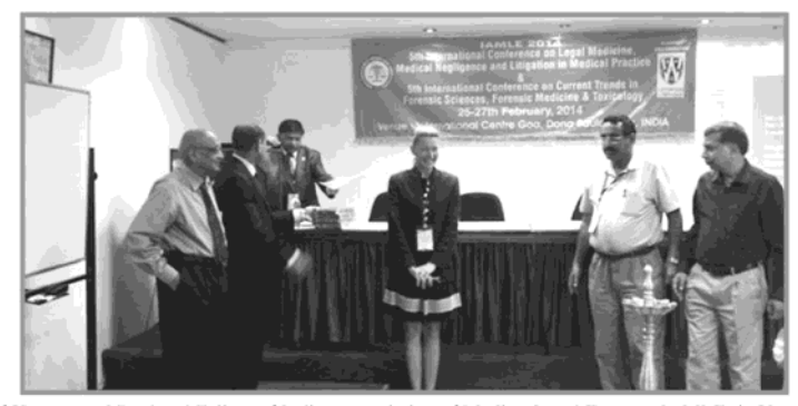
Received Scroll of Honour and Declared Fellow of Indian Association of Medico-Legal Experts (IAMLE) in Year 2014 at "IAMLE 2014", 5<sup>th</sup> International Conference on Legal Medicine, Medical Negligence and Litigation in Medical Practice and 5<sup>th</sup> International Conference on Current Trends in Forensic Sciences, Forensic Medicine and Toxicology held at Goa, India