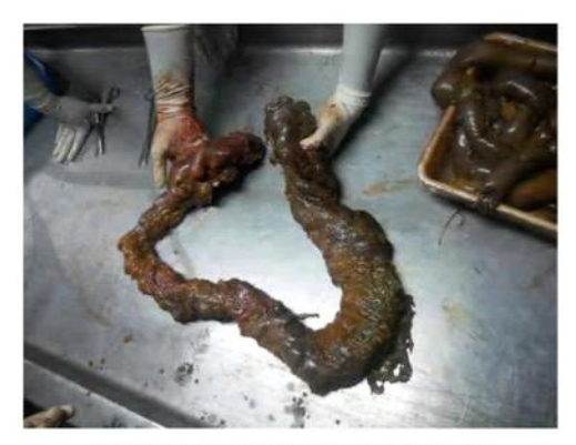
Figure 4 Large Intestines with Capsules