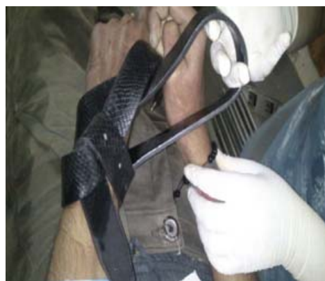
Figure 3 Showing wrists tied loosely in simple loop with no underlying injuries