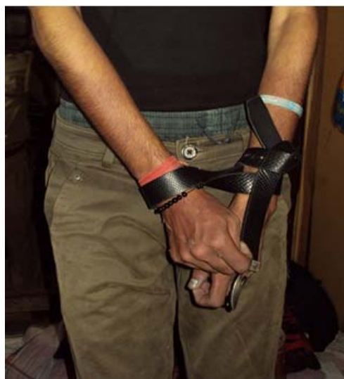
Figure 2 Loosely tied wrists with leather belt and cobwebs sticking on the palm

leather belt on the anterior aspect of the body tied both his wrists. The right wrist was tied in a single loop and his left wrist was tied in a double loop without any knot which can be separated easily ( Figure 2 ). There were no injuries present underneath the knot ( Figure 3 ). The ligature mark, brownish in colour, grooved, non-continuous, and hard like parchment and having a maximum width of 03 cm was present obliquely and incompletely around the neck. The mark was situated 2.8cm below the tip of right mastoid process, 05 cm below the chin, 10 cm above the suprasternal notch and 04 cm below the tip of left mastoid process. On dissection of the neck, the underlying subcutaneous tissue was found pale and glistening with no extravasation of blood and with intact cartilages ( Figure 4 ).