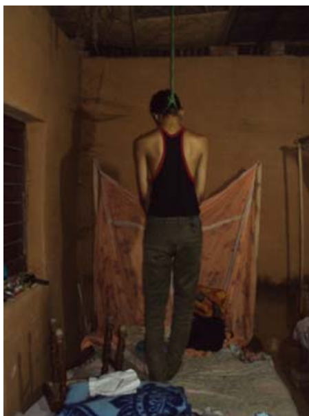
Figure 1 Crime scene picture

The hand of the deceased was observed to be loosely knotted at the front with black coloured waist belt. The gaps between the two hands were 2.6 inches. There were some cobwebs adhered on dorsum of both the hands, supposedly, from the ceiling/beam while fixing knots, etc., ( Figure 2 ).