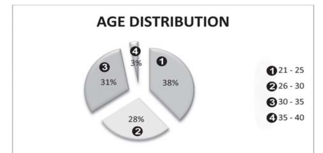
Figure 1 Respondents Socio-Demographic Characteristics in percentage