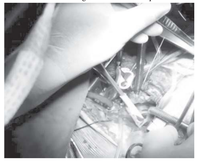
Figure 3 Intracardiac structures after opening of right atrium

One drop-in suckers was placed in the left atrium to maintain a bloodless operative field. Handheld retractor was used to expose the mitral valve ( Figure 2 ). Anterior mitral leaflet excised, complete preservation of posterior mitral leaftlet and submitral apparatus was done to maintain left ventricular geometry. A 27 ATS Medtronic prosthetic valve was seated. Rewarming was started at the time of tying the valve sutures. Prosthetic mitral valve leaflet mobility was checked. Deairing of left side of heart performed. The right atrium was closed using a standard technique.