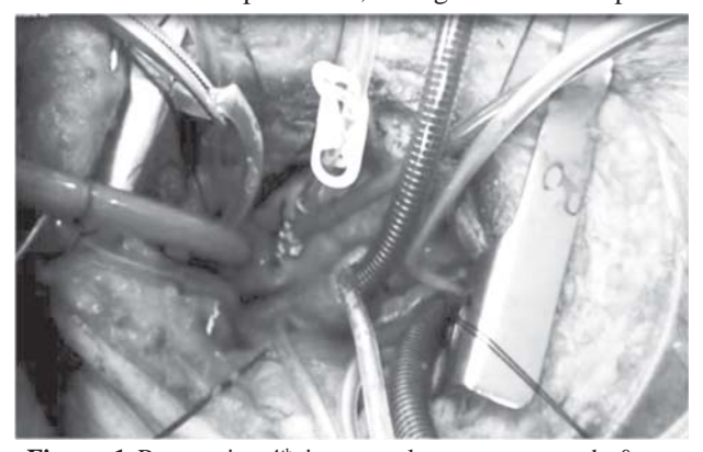
Figure 1 Rt anterior 4<sup>th</sup> intercostal space approach & on cardiopulmonary bypass

and thoracotomy was performed via right anterior 4th intercostals space. Cardiopulmonary bypass was initiated with aortic and bicaval canulation, and systemically cooled to 28 °C ( Figure 1 ). An aortic root vent needle was inserted and connected to vent sucker at 100 mmHg. The patient was placed in the Trendelenburg position. Patient's perfusion pressure was kept at 70 mmHg. Heart rate was maintained between 70-80 beats per minute, and right atrium was opened.