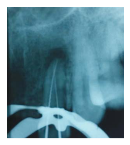
Figure 2 Mesial angulation radiograph

A closer observation of the same radiograph revealed two root canals in 21, a rare morphological variation and in the second radiograph with different angulation revealed additional canal in 21 (Figure 2 & 3). The teeth were isolated with rubber dam and access was done by round bur followed by Endo Z bur (Dentsply maillefer).