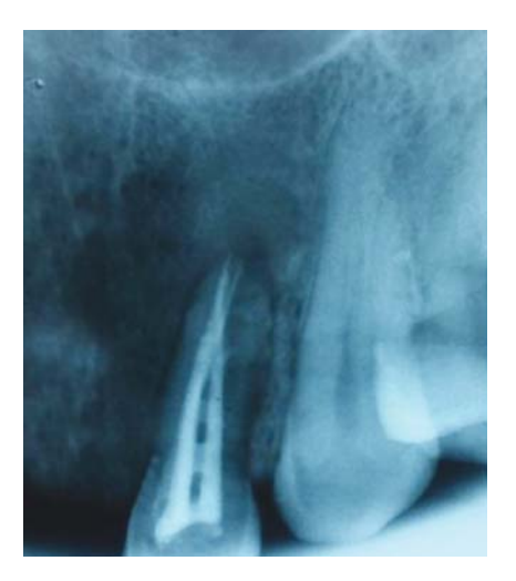
Figure 4 Post obturation radiograph

The canals were dried with sterile paper points and were dressed with calcium hydroxide paste (Pulpdent). The access cavities were then temporarily sealed with cavitemp (Ammdent). At 2 weeks follow up as the teeth were asymptomatic, obturation of the root canals were under taken with laterally condensed guttapercha using lateral condensation technique (Figure 4). Post obturation radiograph was taken and the access cavities were sealed with IRM. The patient was followed up at regular interval of 1, 3 and 6 months respectively. At 6 months follow up; complete resolution of the periapical pathology was observed).