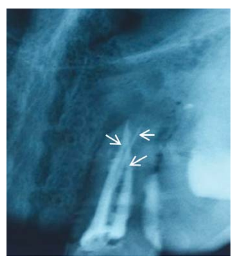
Figure 5 6month follow up radiograph