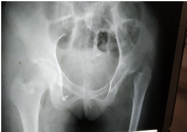
Figure 2: The x-ray of the pelvis after the first operation, showing post Girdlestone osteotomy and skeletal traction.

Initially open reduction was planned for this patient with 2 weeks prior skeletal traction. During surgery, we encountered soft tissues contractures, adhesions, fibrofatty tissue filling of the acetabulum, and enlargement of femur head. This anatomical distortions made it almost impossible open reduction of hip. we decided to clear acetabulum of fibrous tissues and did Girdlestone osteotomy and soft tissue release (figure 2). Post operative skeletal traction with increasing weight was given for approx. 2 months and serial weekly X rays were done. Traction was ceased when the greater trochanter was drawn at the level of articular surface of the acetabulum (figure 3). Then THR was done with uncemented acetabular cup and cemented femoral stem with proximal femoral encirclage (figure 4). The leg lengths were equalized, and the postoperative recovery was uneventful. Roentgenograms showed satisfactory position and fitting of the prosthesis.