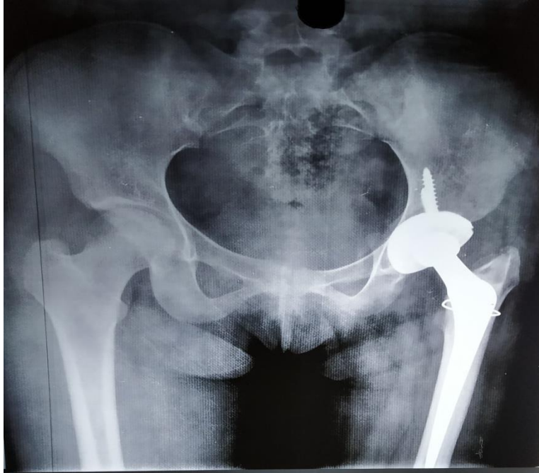
Figure 5: 3 months Post operative follow up pelvic X-Ray of the patient after total hip replacement.

Her physiotherapy was started soon postoperatively, and she was discharged on the fourteenth postoperative day. Her functional status improved on every successive follow-up visit, and the HHS score improved from 48 (preoperatively) to 87 (postoperatively). She had no pain, a mild residual Trendelenburg gait due to her abductor insufficiency and excellent function.