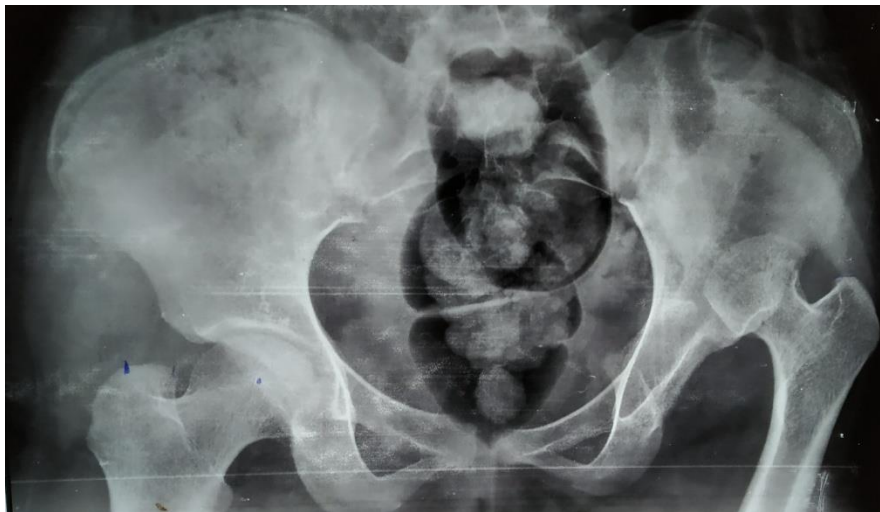
Figure 1: Pre-operative x-ray of the pelvis, showing neglected left posterior hip dislocation.

We saw this patient 7 years after the initial injury complaining of hip pain. She was walking with an antalgic gait and had a decreased range of motion of her hip. The limb was in fixed adduction and internal rotation. She had a leg length discrepancy due to 5 cm shortening of left lower extremity. Her hip movements were restricted and painful. Radiographs confirmed a persistent dislocation of the hip, with a false acetabulum in the left supra-acetabular region(figure 1).