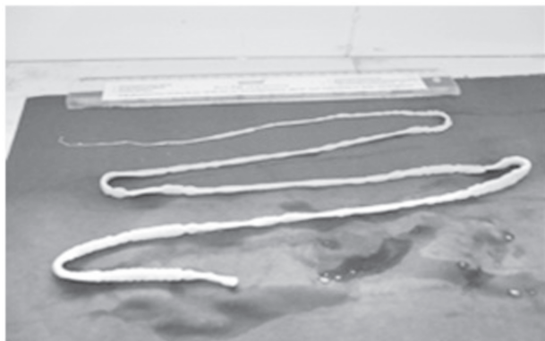
Figure 1 Taenia saginata (naked eye)