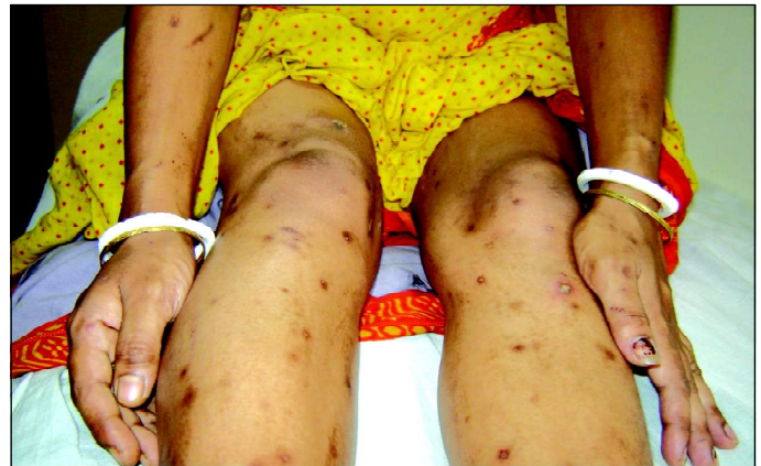
Figure 3 Prurigo of Pregnancy

Out of 150 pregnant women, 15 (10%) cases had specific dermatoses of pregnancy, among which prurigo of pregnancy was the most common specific pregnancy dermatoses accounting for 12 (8%) cases ( Figure 3 ). Studies in the Indian context reported pregnancy-specific dermatoses as low as 2% to as high as 38.3%. 1,7-14,18 Pruritus gravidarum was observed in 2 (1.3%) cases, out of which one was primigravida and the other was multigravida with a history of itching in previous pregnancies. Pruritus started between 28-32 weeks of pregnancy without skin lesion. In both cases liver function test was found to be altered. A study reported Pruritus gravidarum in Indian women as 1.1%. 16 In our study, only 1 (0.67%) case of Pemphigoid Gestationis was found. The patient was a multigravida in her second trimester. Low percentage of Pemphigoid Gestationis was reported in some other studies. 15,18