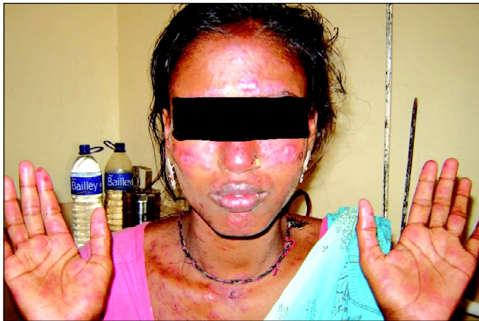
Figure 5 Systemic lupus erythematosus

Among the study participants, 12.6% were observed with non-infective dermatoses. Other studies from India reported non-infective dermatoses during pregnancy as 4% to 11%. 9,10,14 In our study, acne vulgaris was observed in 14 (9.3%) cases. Also, vitiligo and urticaria were found in 2 (1.3%) patients each. The findings agree with a study. 7 Systemic lupus erythematosus (SLE) was found in 1 (0.7%) case with a past SLE history ( Figure 5 ). Severe exacerbation was observed as SLE during pregnancy may precipitate or flare up during pregnancy. 15