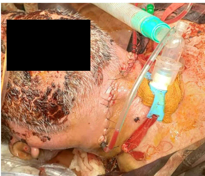
Figure 4b After the repair

In another instance, a patient previously repaired with laryngoplasty in the Department of ENT came with a second incidence of suicidal CNI. The patient was examined; clots were removed, and the tracheal breach was found with a suspected laceration of significant vessels. The cuffed tracheostomy tube was applied, the wound was covered with a compression bandage, fluid resuscitation was done, and it was planned for shifting to ENT-OT for emergency repair. But owing to excessive blood loss, the patient died within 7 minutes after receiving it in casualty.