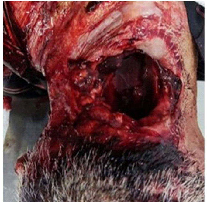
Figure 2 Cut-neck-injury extending up to the thyrohyoid membrane