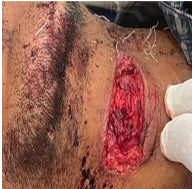
Figure 3 Cut-neck injury extending skin and subcutaneous tissue involving platysma

As shown in Figure 3, the patient presented with a suicidal CNI after inflicting a homicidal attack on his wife. There was severe bleeding, and a compression bandage was applied to stop the bleeding for some time. Fluids and haemocoel transfusions were